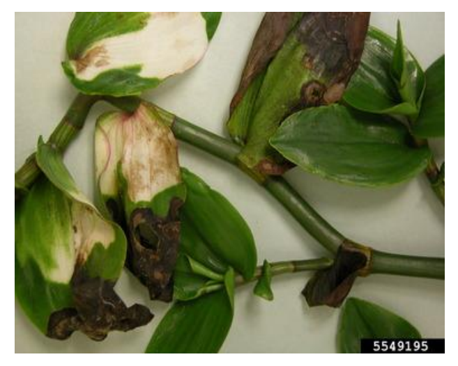
Figure 3. Dark-brown lesions on the leaves