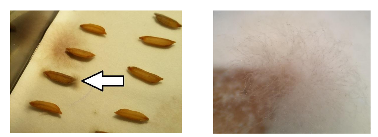
Figure 7: Fungal mycelia (left arrow, amplified on the right (Source: http://www.agronomicabr.com.br/files/1-alternaria-2a.jpg)