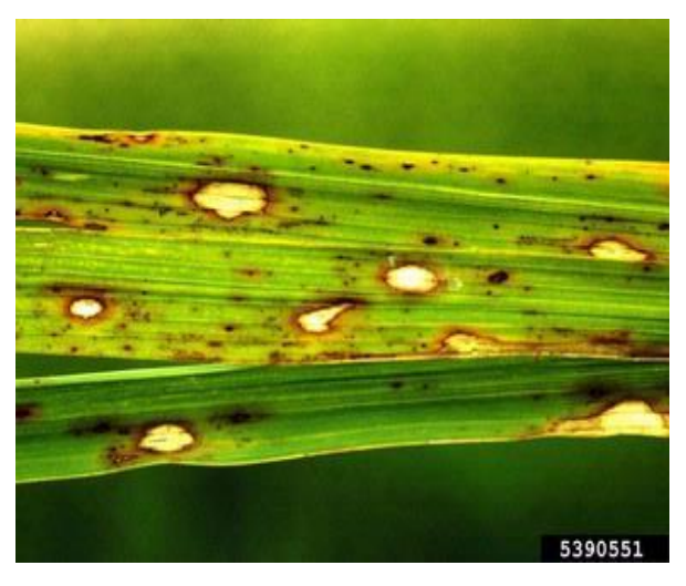
Figure 4. Dark-brown lesions on the leaves